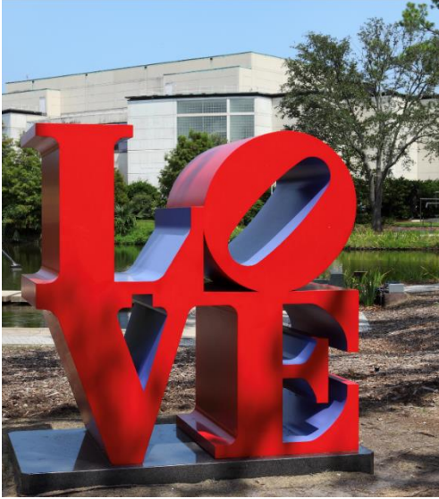
Robert Indiana, LOVE (Red Outside Violet Inside), 1966 to 1999 Conceived:1966 Executed:1999, Polychrome aluminum, 182.9 x 182.9 x 91.4 cm.