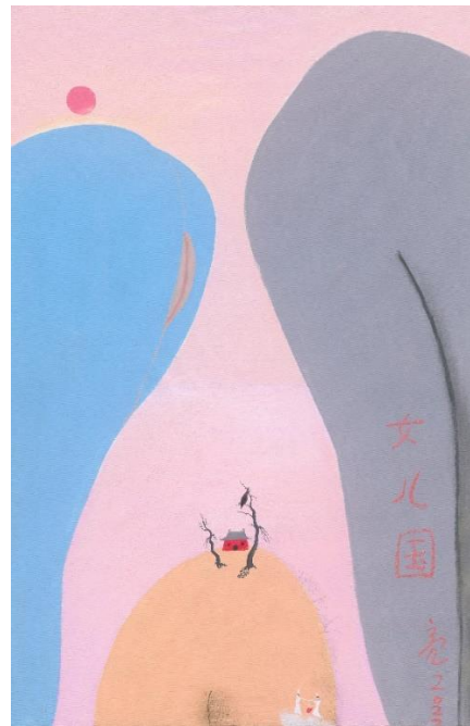
Shenliang, Kingdom of Women, 2022, Acrylic on canvas, 165x107cm.