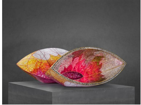
Pooya Aryanpour, Elysian Fruit 7, 2022, Kiln-fired dyed glass, mirror fragments and plaster on wood (diptych), 80 x 180 x 112 cm (each), 31 1/2 x 71 x 44. Courtesy of the artist and Dastan.